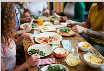
2nd & 4th Wednesday of the Month

The Community Meal 2nd & 4th Wednesday each month from 5:30 - 6:30pm in the Social Hall.