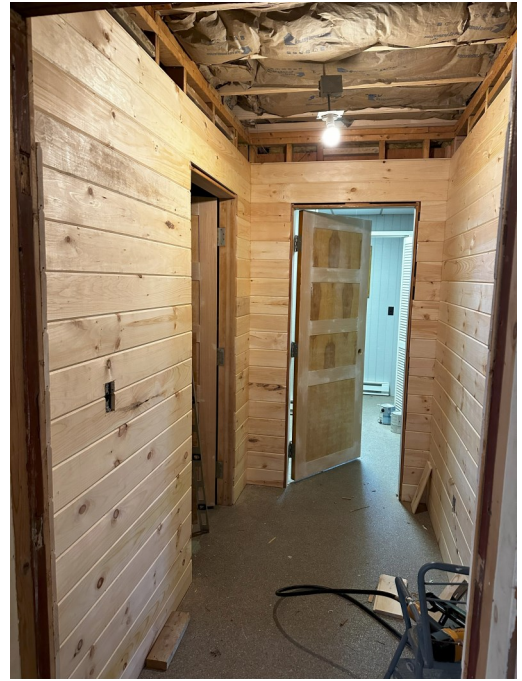
Hallway to Bunkroom & Bathroom

This past month, the Kentland interior has really begun to take shape. The new ceiling and LED lights make the space look clean and bright, while the pine walls give it that rustic feel that we were hoping for. The restored fireplace now looks better than I ever imagined!