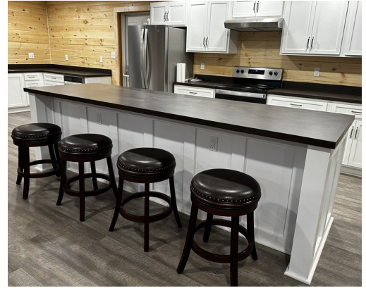
Island Bar Stools