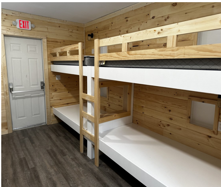
Single Bunk Beds