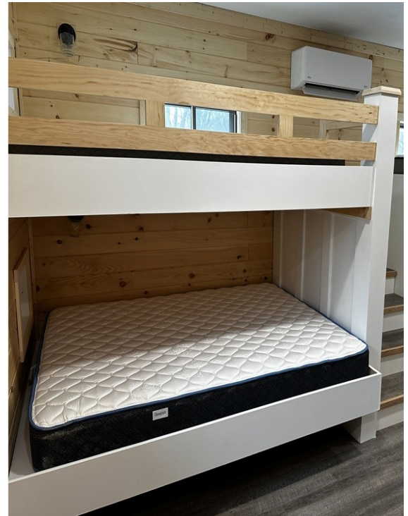
Double Bunk Beds