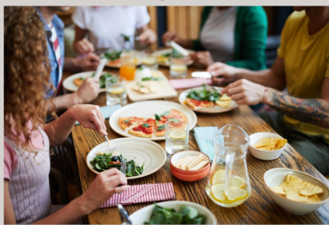
2nd & 4th Wednesday of the Month

Join us for the Community Meal on the 2nd & 4th Wednesday each month from 5:30 - 6:30pm in the Social Hall.