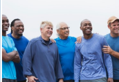
Men of Grace